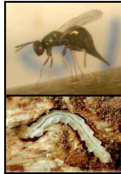
EAB / Tetrastichus planipennis