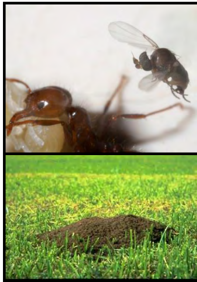
IFA / Phorid Flies

...it's all about knowing your enemies and squashing them like with bugs !