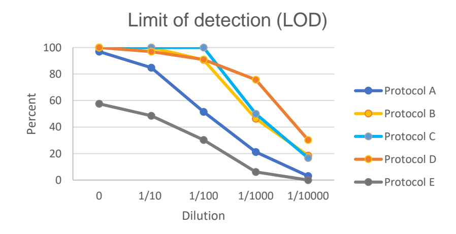
Figure 1 . Limit of detection (LOD) for all protocols tested (A-E) in undiluted to 1/10000 diluted RNA samples extracted from ToBRFV-infested tomato seeds.

Defined as the percentage of samples containing detectable target (ToBRFV) at a given concentration. Values ranged from 0% for negative samples (no virus present) to 100% (all samples containing virus are detectable at the specified concentration). LOD results for all protocols are shown in Figure 1. Protocols B, C and D yielded the lowest LOD. Protocols B and C had an LOD of 50% when the diagnostic sample was diluted 1/1000, while Protocol D had an LOD of 79% .